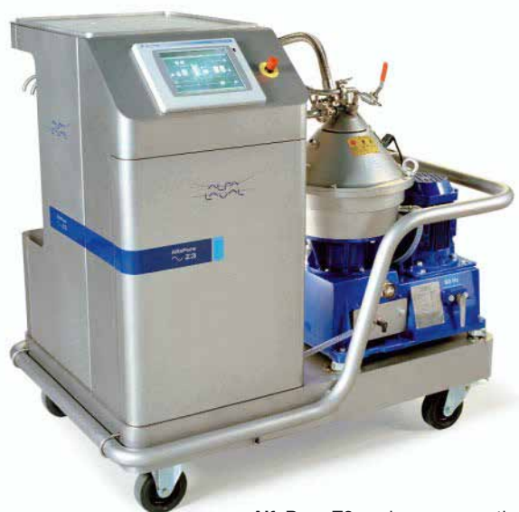
AlfaPure Z3 – a larger separation system from Alfa Laval.

Our total product range includes some 20 separators that also treat wash liquids, oils, other emulsions and paint waste. Alfa Laval is also the world's leading supplier of heat exchangers, helping customers around the world heat, cool and transport any type of fluid.